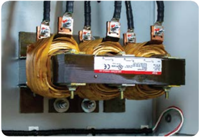
Line Reactor Standard Option Available