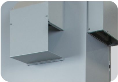
Back Channel Cooling Standard on 150+ HP