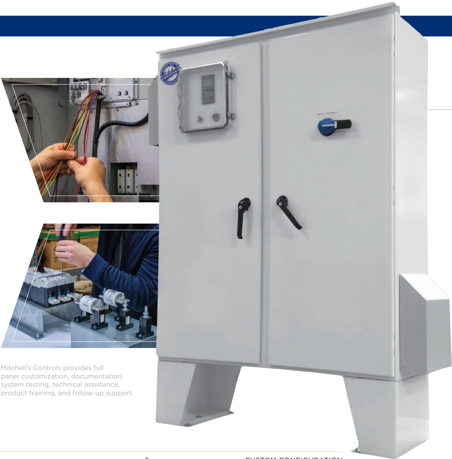
Mitchell's Controls provides full panel customization, documentation, system testing, technical assistance, product training, and follow-up support.