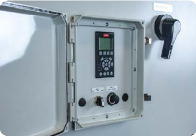
Door Mounted Keypad Metal Handle & Locking Tab